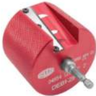
DEB1 Series Deburring Tools – Drill Powered