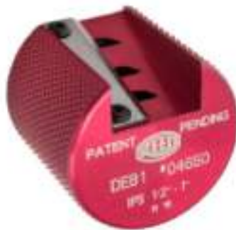
DEB1 Series Deburring Tools for Plastic Pipe